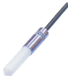
Separating layer sensor SEPARIX-C H