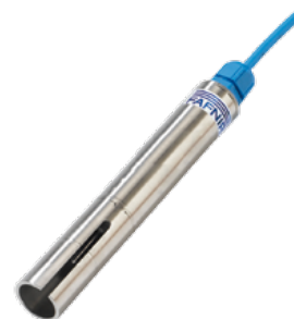
High-level sensor SEPARIX-T H