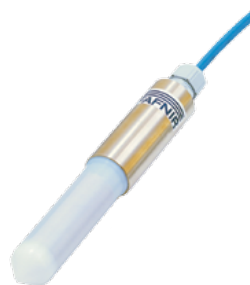
Separating layer sensor SEPARIX-C L