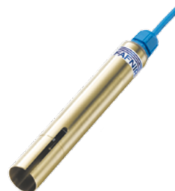
High-level sensor SEPARIX-T L