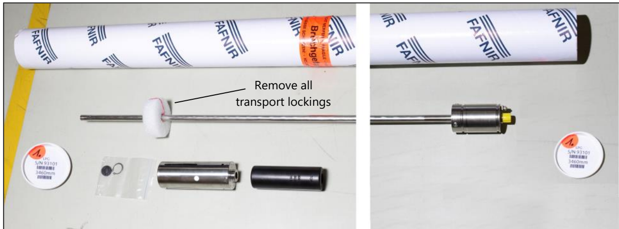
Figure 4: Accessories position