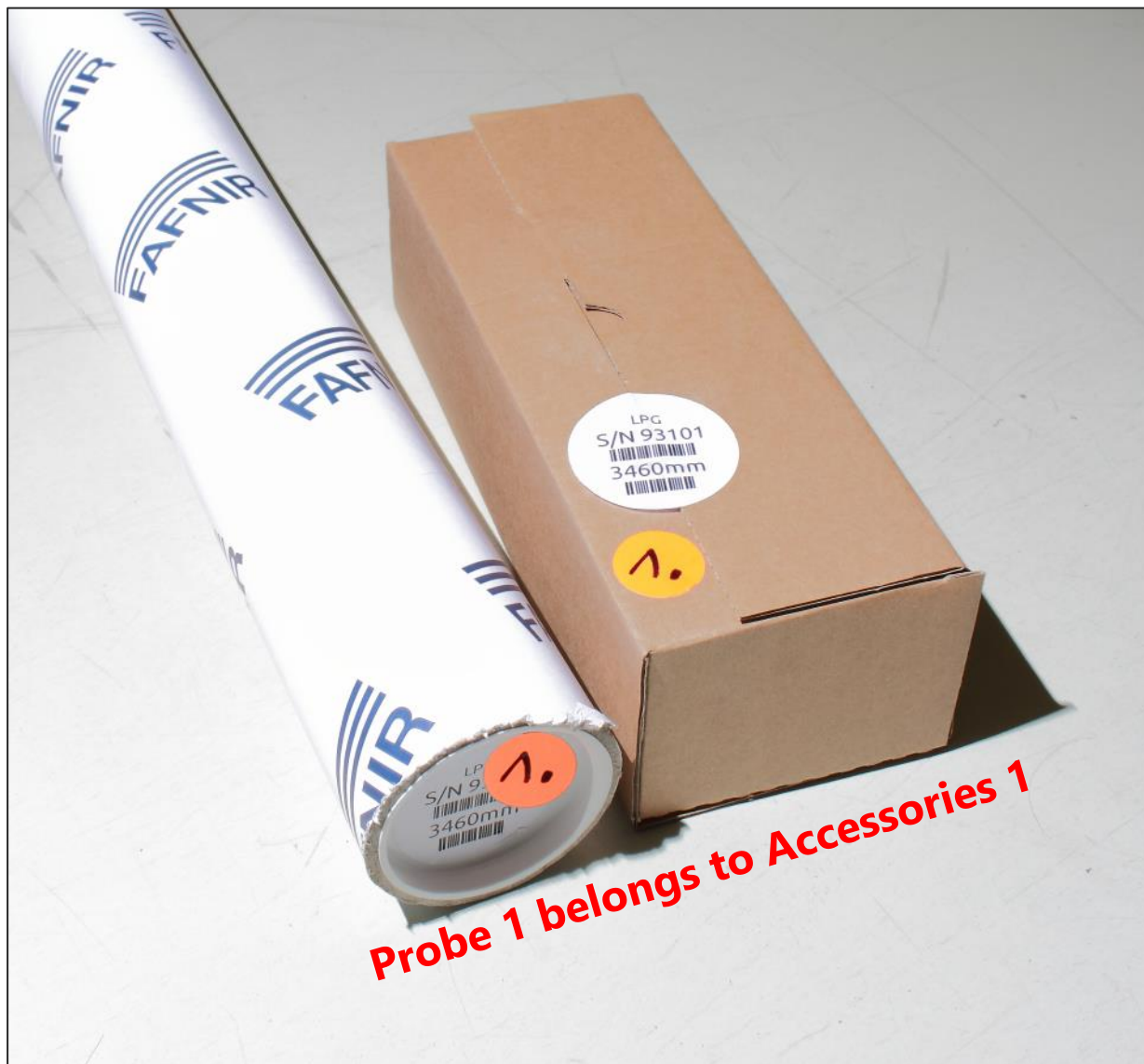
Figure 1: Scope of delivery: probe and accessories