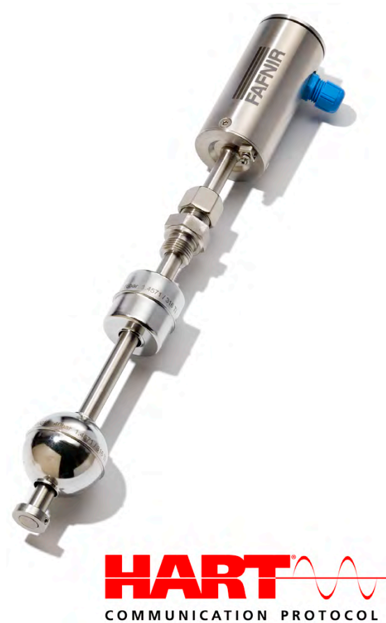
Fig. 1: Picture of the Level Sensor TORRIX

The name plate is located on the TORRIX probe head.