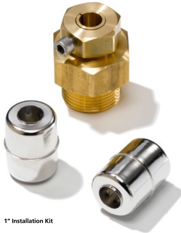
1" Installation Kit

The optional installation kit comprises a product float, a water float and a screw-in unit. It makes it possible to install a VISY-Stick using an R1 threaded coupler. The screw-in unit is also available in stainless steel.