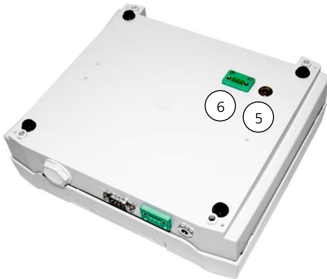
Figure 2: VISY-View Touch rear