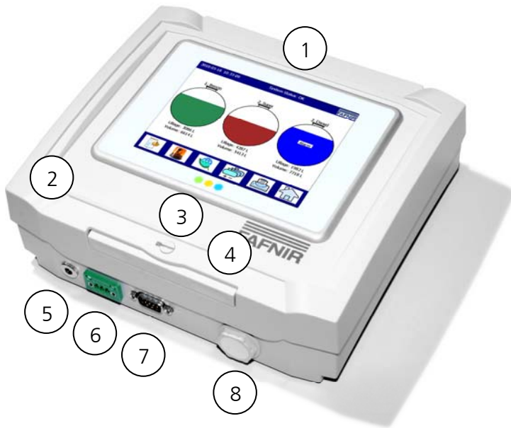
Figure 1: VISY-View Touch front