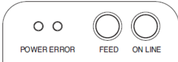
Figure 1: Control panel

The control panel has two indicator LEDs and two buttons.